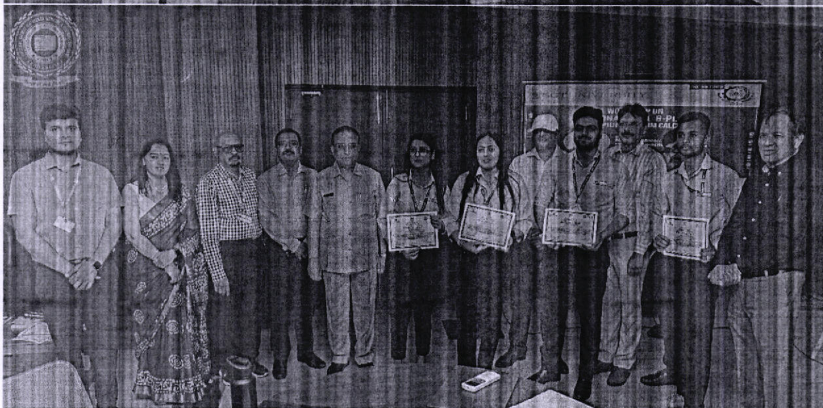
Students being awarded for their outstanding performance