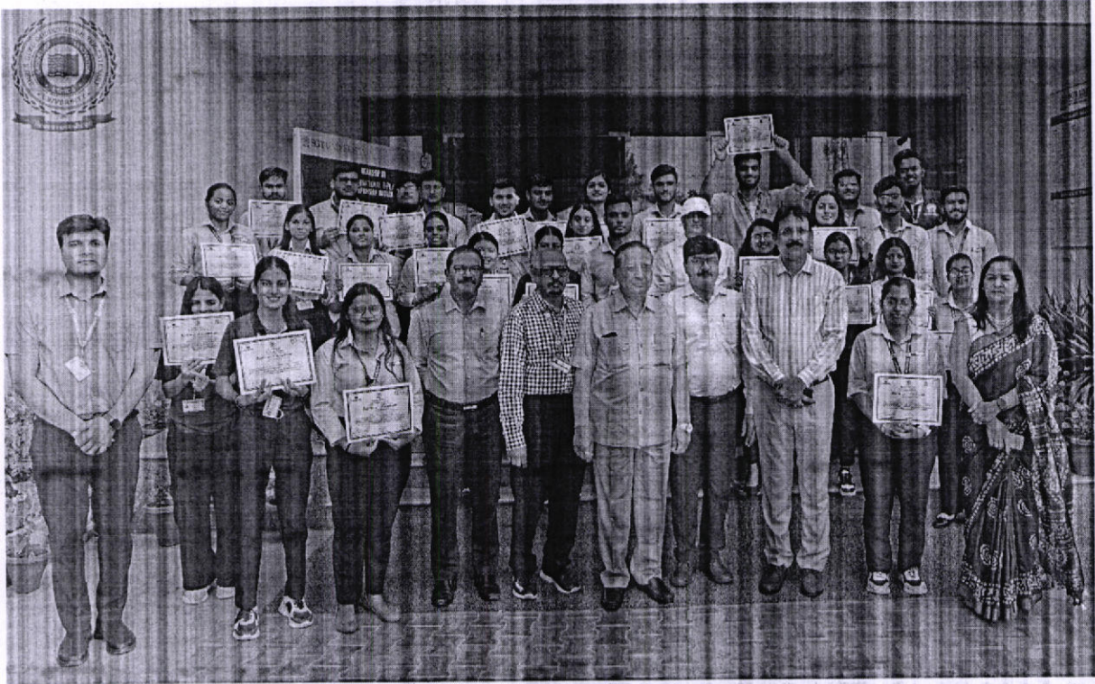
Group photo of all the participants with the faculty organizers